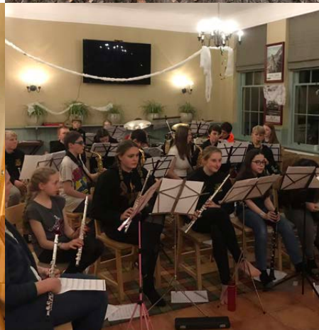
EXCELLENT REHEARSAL SCHEDULE