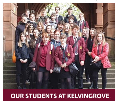
OUR STUDENTS AT KELVINGROVE

In June, both our NPA and Higher Photography students had the opportunity to take a trip to Glasgow and experiment with different types of photography. Our students first set off to the SSE Hydro to study some modern architecture. They captured some great photos of the buildings they felt were the most interesting. They were then let loose in Kelvingrove Museum and Kelvingrove Park! This year, as usual, we have some very talented students and we look forward to seeing what they produce within this coming year.