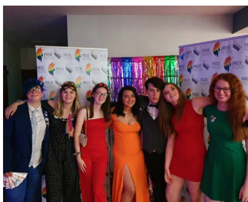
OUR PUPILS SHOWING THEIR PRIDE

evening, in which many pupils from different schools came together to celebrate in a safe environment and forge new friendships. This project brings young people together for a fun-filled evening, where they can relax and enjoy being in the company of others from their community.